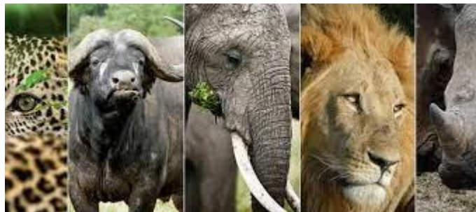
Africa – The Big Five (Badgers and Hedgehogs)