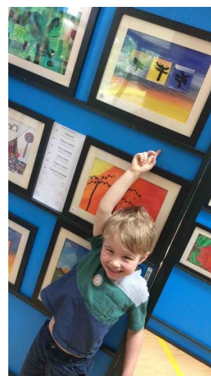
Finding our fabulous paintings in the Art Exhibition!